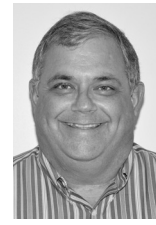
Jim Malas Scholarship