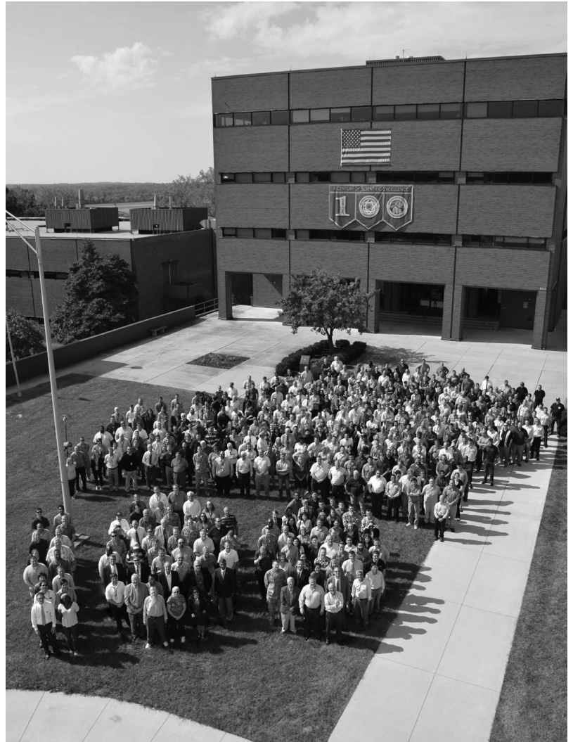
A Hundred Years of Scientific Excellence!