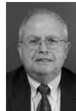
Charles Browning Scholarship