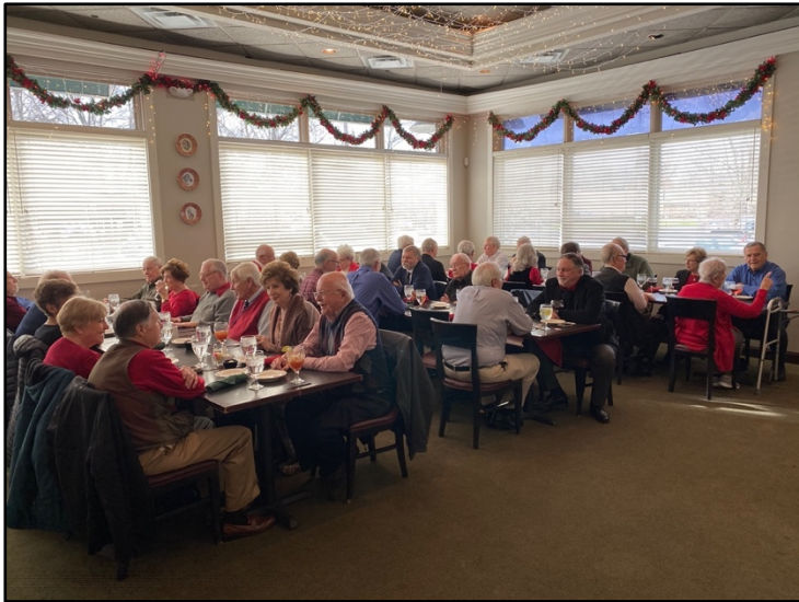
December 2019 Christmas Luncheon at the Wellington Grill in Beaver creek