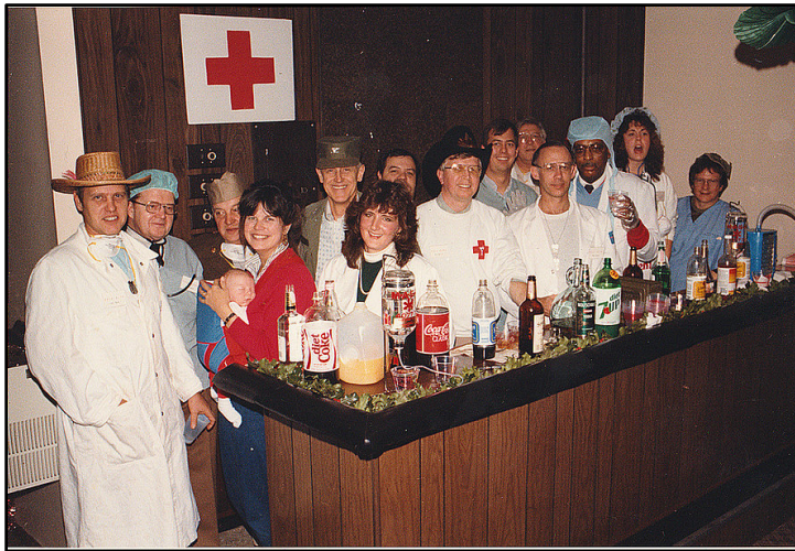
1985 ManTech Christmas Party