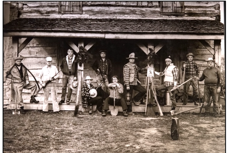
Unspecified Date and Location