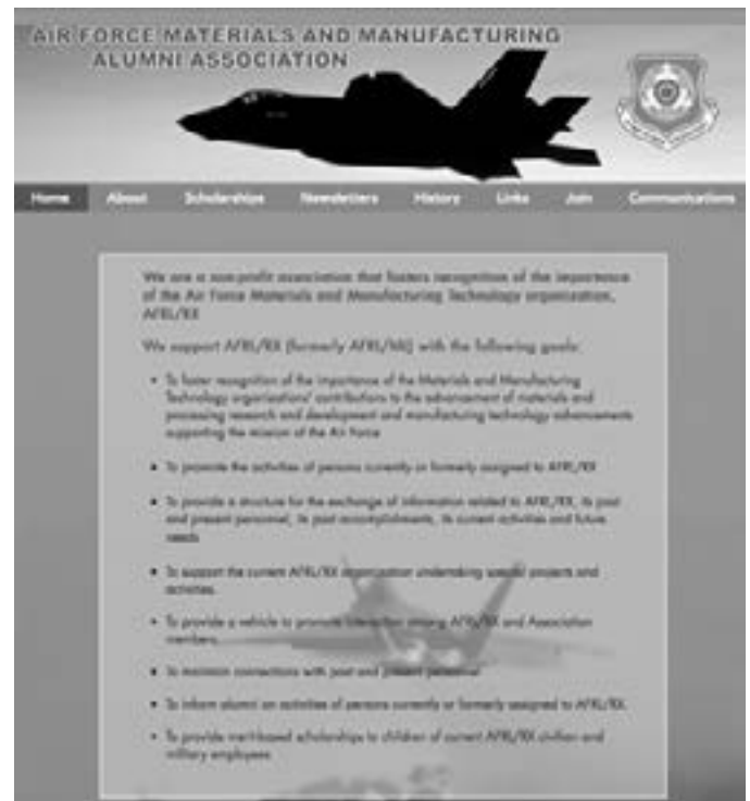
AFMMAA Website Screenshot at www.afmmaa.org

The AFMMAA web site— www.afmmaa.org —is undergoing an update that includes a new look and new features. A notable aspect of the site is the addition of a history page. This is described in more detail in a separate article in this newsletter, but it's worth pointing out that this page is representative of what we hope will be a site that could be a truly informative vehicle for alumni use. Rather than being just a "calling card" for the association, it can perhaps have a more active role. Obviously, like most web sites, it displays basic information about the organization and its functions, but there may be other features that could prove valuable. In our case, for example, we have a page containing all the previous and current newsletters, a page for dues/donations payment or for anyone wanting to join the organization, and a page that provides a means for member general communication.